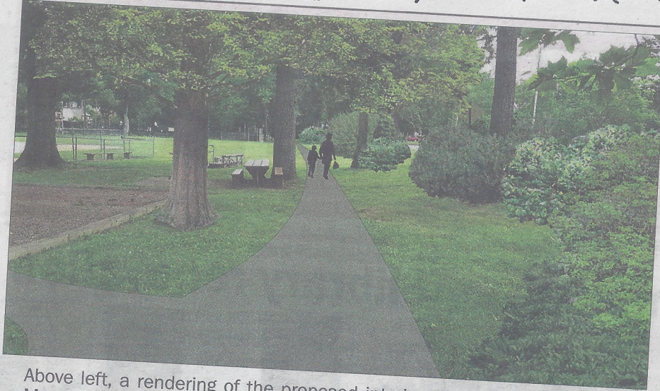
Above left, a rendering of the proposed interior pathway in Maplewood Memorial Park. At right, a map shows Maplewood Memorial Park and plans for an interior pathway. The conservancy's aim with this proposed project is to restore landscaping originally intended to buffer the park from the busy roadway along Valley Street as well as to connect this area to the rest of the park's interior pathway system, allowing walkers, runners and field users to avoid the sidewalk.