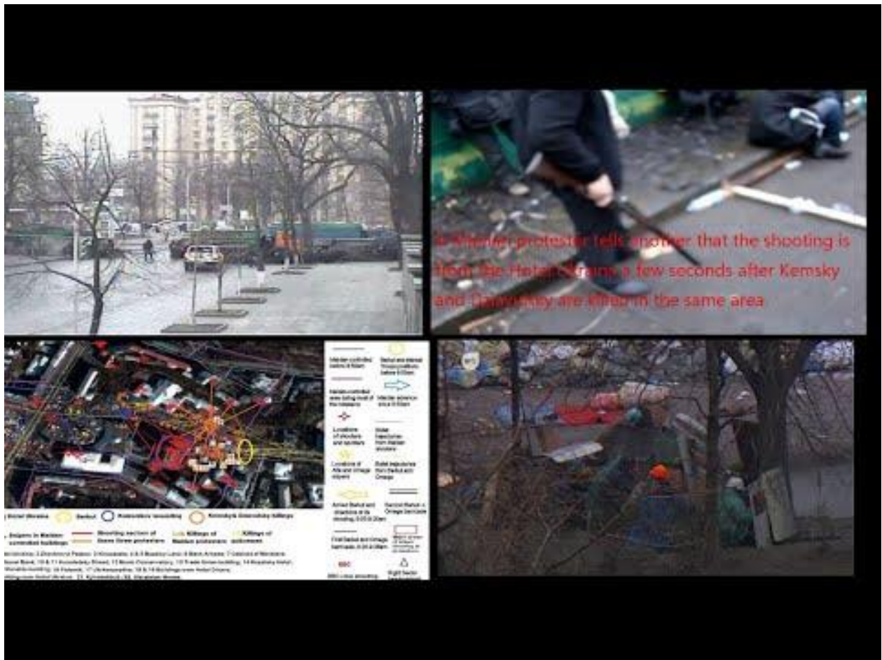
Video Appendix H : How Maidan Protesters Were Shot from Maidan-Controlled Buildings