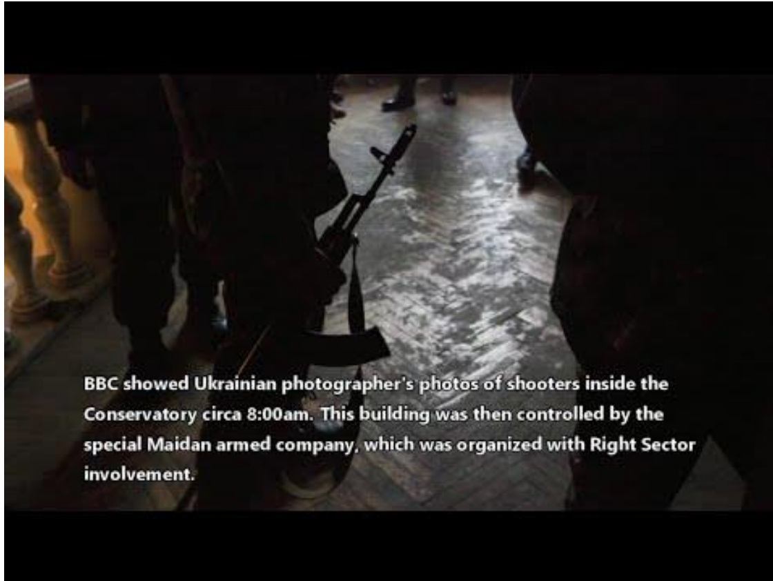
Video Appendix A : The “Snipers’ Massacre” on the Maidan in Ukraine (2011)