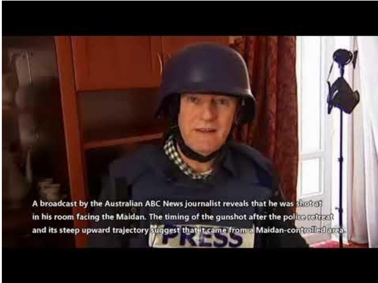
Video Appendix F : Shooting at Western, Polish, and Russian Journalists during the Maidan Massacre in Ukraine