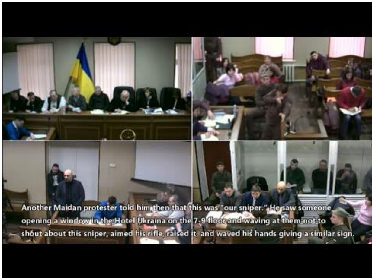
Video Appendix E : Testimonies by Dozens of Prosecution Witnesses at the Maidan Massacre Trial & Investigation Concerning Snipers in Maidan-Controlled Locations