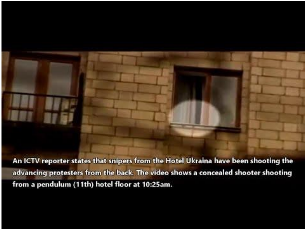
Video Appendix C : Shooting of Maidan Protesters from Maidan-Controlled Locations (2020)