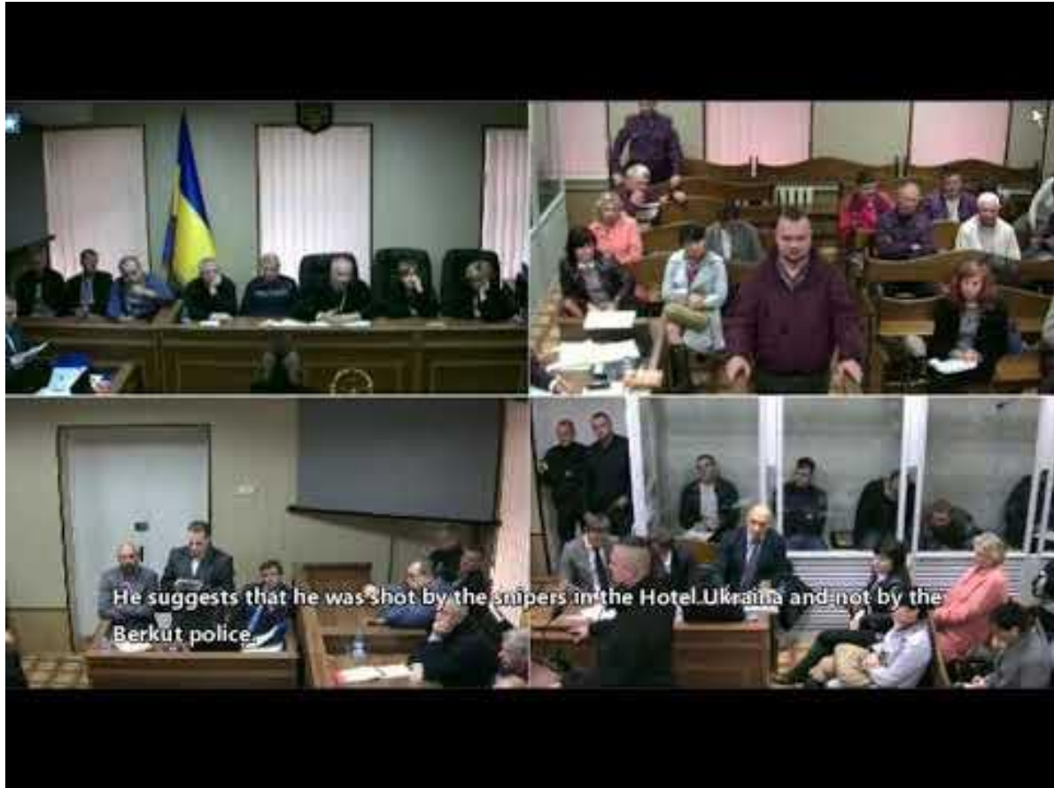
Video Appendix D : Maidan Massacre Trial and Investigation Testimonies by 47 Wounded Maidan Protesters about Snipers in Maidan-Controlled Locations