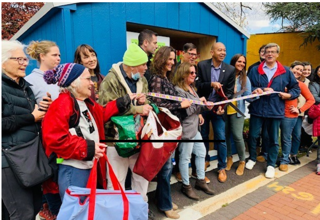
Ribbon cutting at the Maplewood Community Fridge grand opening on November 13, 2021.